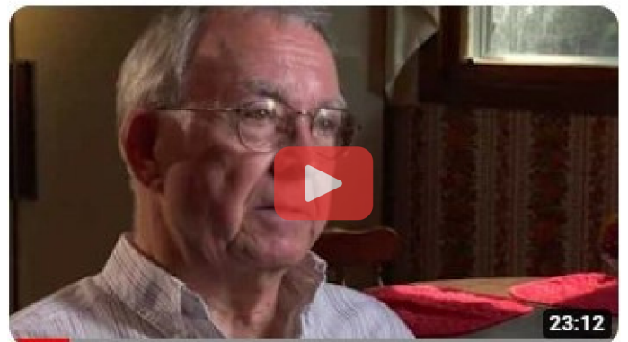
Standing Up, Fighting Back (Consumer Protection video)